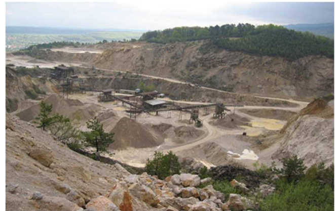
Figure 2 Mining of granodiorite in Hradová quarry

In this contribution, we solved a problem with inventory in the quarry Hradová. By the EOQ model (equation 6) - Wilson Adler equation we looked for optimizing state of inventory raw material granodiorite in a mining company, which extract granodiorite by surface mining for the purpose of adjustment, used as an aggregate in construction. The extracted raw material is stored in the quarry and the mining company solves a place for the storage of raw material - granodiorite (figure 2). Place for store raw material - granodiorite is big problem for mining company, that must be solved. By the optimizing model, we can decrease volume of raw material for a store in the quarry Hradová.