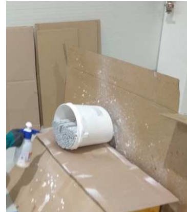
Figure 1 Direct contact of operators with flux

barrier separating it from the flux aerosol. The employee responsibly used a gas mask and the prescribed protective for the given task. However, from a long-term perspective, a process such as this is ergonomically and safely unacceptable for workplace workers, as the flux enters the environment in the form of fine particles, which can cause health problems in long-term exposure.