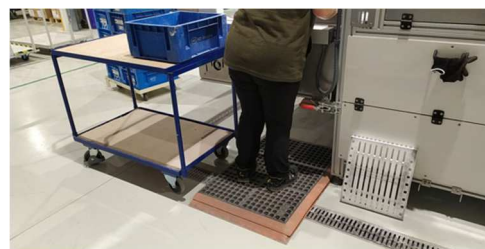
Figure 6 Application of anti-fatigue mats to the workplace

This health risk has been reduced by the provision and use of ergonomic anti-fatigue mats (Figure 6) in the standardized size of 600x1200 mm, which is available to every worker in the workplace performing long-term work while standing. Anti-fatigue mats eliminate the danger associated with working in one place.