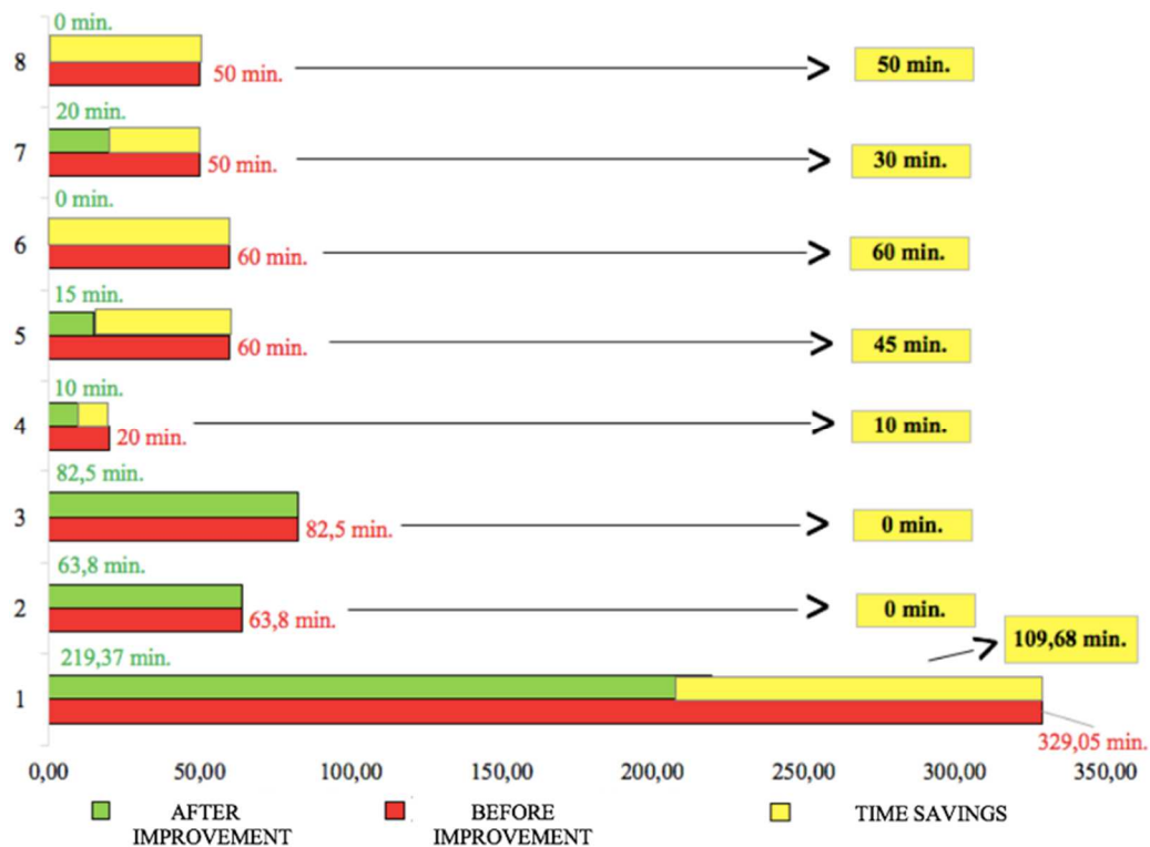
Figure 7 Time savings

3 – the time required to influx the daily demand of RAD headers (TA), 4 – model exchange (TB), 5 – starting time (TB), 6 – shift cleaning time (TB), 7 – end day cleaning time (TB), 8 – breaks (TC).