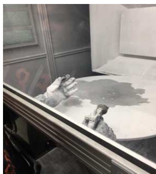
Figure 5 Method of spraying in the box

When designing the machine for manual flux application, it was necessary to ensure impermeable isolation of the interior spaces from the external working environment of the employees. After installing the