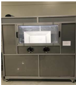
Figure 4 Spray box

To eliminate the already mentioned direct contact of the flux with employees, a spray box was purchased for the workplace. It is a closed space of 2x2 meters, where the flux is applied with a pressure gun to the inner ends of semi-finished products. The method of applying flux in a spray box consists of manually applying a flux layer by a spray nozzle identical to the nozzle in the flux chamber of the machine, except for those product areas which are not available for flux in the machine chamber. The operator takes the required number of products, puts them inside the box on a turntable, then applies the flux to each side and lets them dry for about two hours. Operators are protected this way from the flux aerosol, which used to be dispersed into the space around them by manually applying flux to the inner ends of the manifolds. The spray box and its method of spraying are shown in the following Figures 4 and Figure 5.