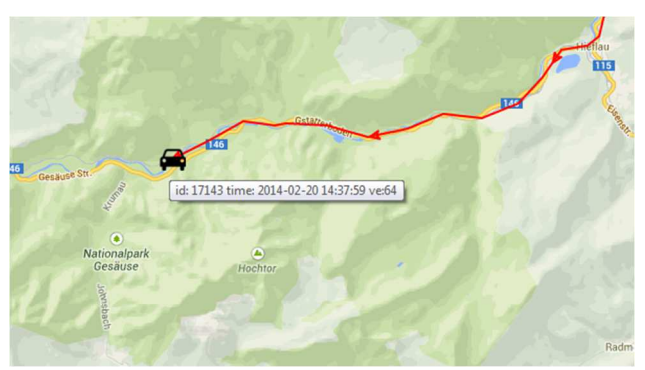
Figure 2 Online actual position with last 10 positions

Position – actual position, designed system allow visualizing actual position, speed, direction and the other data from sensors. See figure 2.