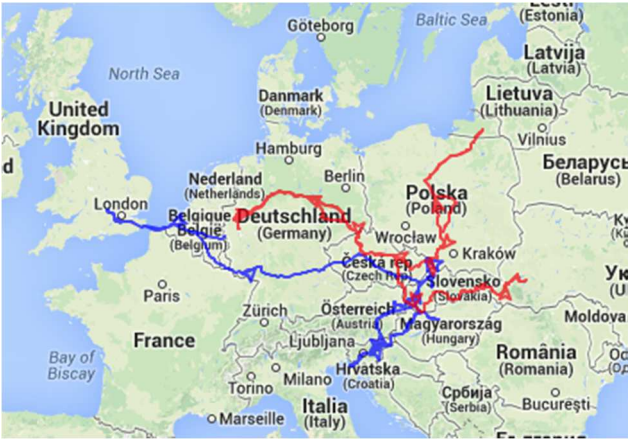
Figure 3 The routes of two containers

Crash detection – using the accelerometer it is possible to detect cargo crash. Accelerometer in GPS tracker is checking the force vectors and after the exceeding allowed value in resulting force vector GPS tracker sends the information about crash and buffered data for a more detailed analysis to a server. We have not still crash detection fully solved because for example when the cargo is loaded or is manipulated with it sometimes the resulting force vector is greater or equal then crash force vector. Because of these situations it is appropriate to check another data of cargo sensors (position, speed, etc.) to determine if it was really an accident or not.