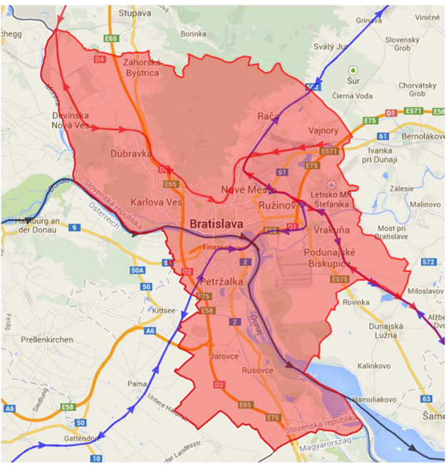
Figure 4 The routes of containers in selected region

Marek Kvet; Ľuboš Takáč; Michal Zábovský