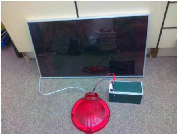
Figure 3 Photo of the developed device of solar-energy harvesting system with the lighting signalization

Peter Danišovič; Michal Hodoň; Michal Chovanec