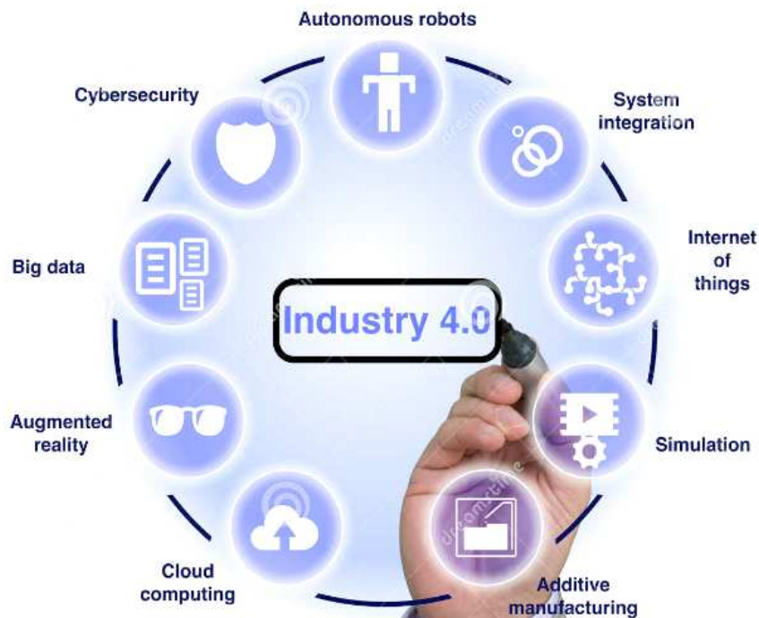
Figure 2 The main technologies of Industry 4.0 [11]

The production technology of Industry 4.0 is not a technology from the far-away future. In July 2015 the Changing Precision Technology (Dongguan, China) became the first factory where only robots work. Each labour process is executed by machines: the production is done by computer operated robots, the transport is implemented by self-driven vehicles and even the storage process is completely automatic.